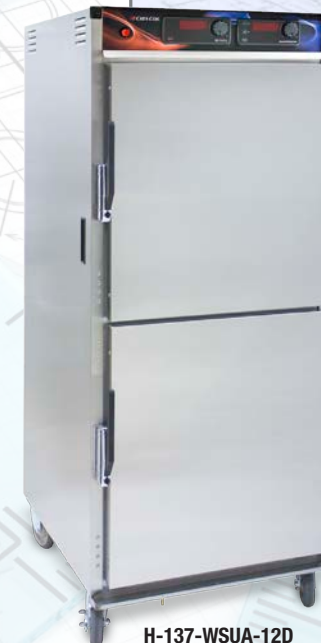
H-137-WSUA-12D Humidified Hot Holding