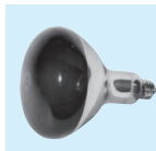
0820-001 INFRARED BULB