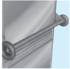
1087-000 PUSH HANDLE