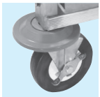
1301-002 ROTARY BUMPERS