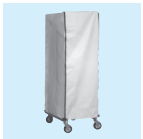
5234-039 RACK COVER