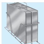
0645-003 KEEPER CARRIER