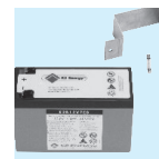
7027-008-K BATTERY KIT