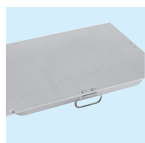
K-1218 KOLD KEEPER®