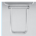
1409-010 DROP DOWN HANDLE