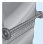
1087-000 PUSH HANDLE