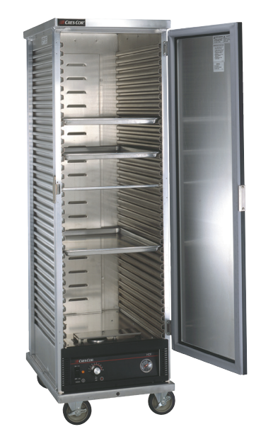
Model shown: 1301836D

NOTE: This product does not pass California energy standards and therefore cannot be sold into the state.