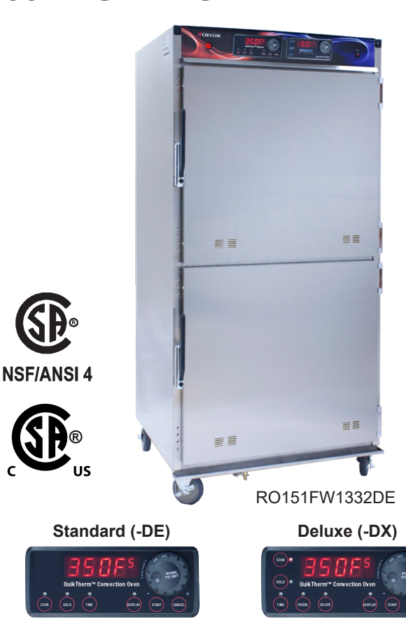
All Ovens come standard with easy-to-read and operate LED digital controls.

5925 Heisley Road • Mentor, OH 44060-1833 Phone: 877/CRESCOR • Fax: 440/350-7267 www.crescor.com